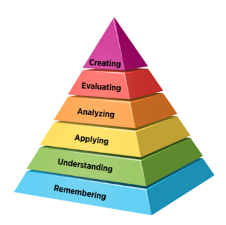
Figure (2): Bloom's Taxonomy

Bloom's Taxonomy is a convenient way to set educational goals in a learner-centric classroom. It allows instructors to describe the degree to which their students need to understand and use concepts, to demonstrate particular skills, and to have their values, attitudes, and interests affected. More information on how to set educational goals based on Bloom's Taxonomy is given during regular workshops presented by the center of Center for Excellence in Teaching and Learning.